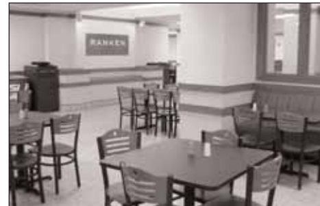
Photo of renovated dining hall

bookstore purchases and access entry into certain areas of campus such as Walker Hall. Ranken 1Cards are now available for all students and employees from the Department of Public Safety.