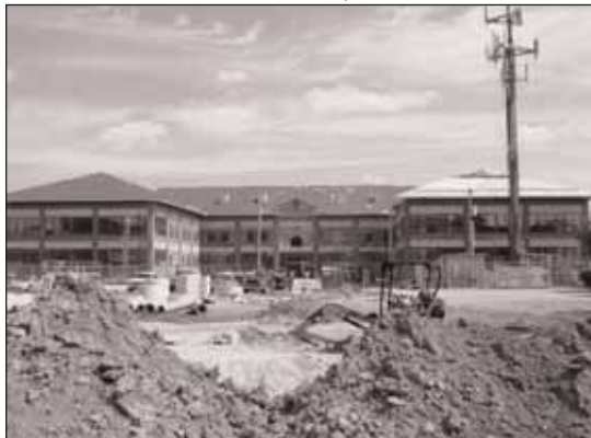
Photo of new dorms under construction

Myrtle and Earl Walker Residence Hall are all nearing completion. This has been a busy time but when all is said and done, these improvements will put a new and modern face on Ranken.