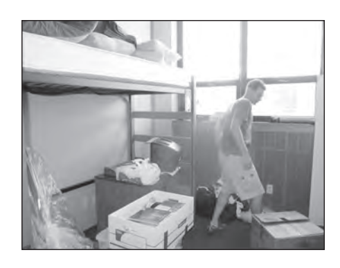
Photo (left): A new student moves into his room inside one of the four-bedroom suites.