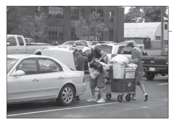
Photo (right): Student ambassadors helped residents move their belongings into their new rooms.

Photo (left): A new student moves into his room inside one of the four-bedroom suites.