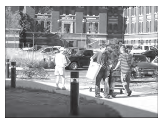
Photo: Walker Hall residents moved into their rooms the weekend before school started.

Returning residents of Walker Hall will notice many changes since last semester. The exterior of the building is very near completion with the addition of landscaping, the security station has been installed, the recreation center has been completed with the addition of a pool table and a foosball table, and the work out room now has weights and cardio equipment.