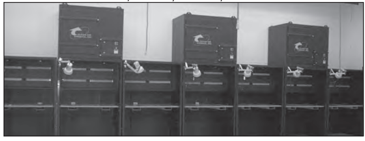
Photo: New welding stations that will be a part of the new welding and fabrication lab to open in January 2010.

Center and should be completed by January 2010.